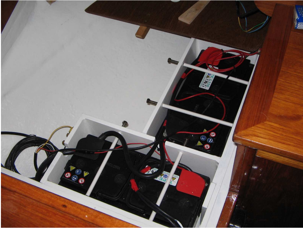
Pic 4 & 5. The finished battery storage (note the retainers are not fully screwed home)